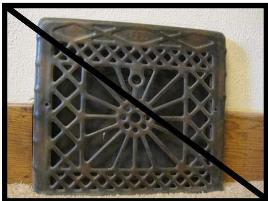
1. Hot air registers—dry, heated air blowing directly on the back of a piano is particularly bad for the soundboard.

Environment: While tuning, repairs, regulation and voicing are the job of the technician, seeing to it that your grand piano is placed in an appropriate spot within your home is up to you. What is needed, as much as possible, is a location where temperature and humidity are kept at moderate levels year-round. Drafty locations, or areas where wide swings in either temperature or humidity occur (unheated porches, moldy basements, etc.) are unsuitable for a piano. In particular avoid placing your piano in front of either of the following: