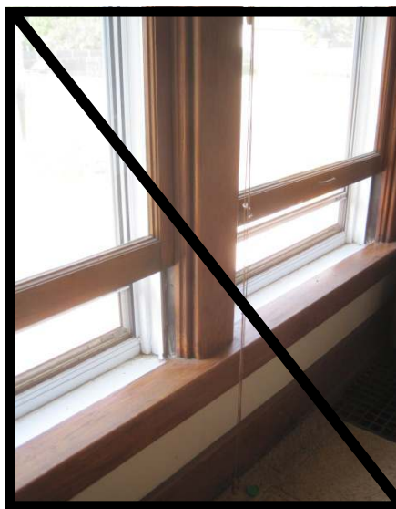
2. Drafty windows.

Note: Effective humidity control equipment, either for the home in general or the piano in particular, will aid in keeping your piano in top form.